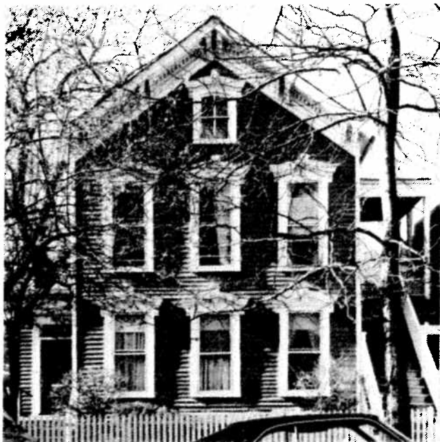
This house at 1802 North Lincoln Park West was built in 1874.